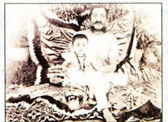
■ The Nizam of Hyderabad with his son, c. 1909