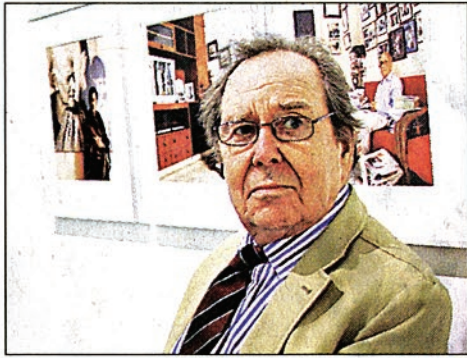
■ SAY PARMESAN: Lord Snowdon