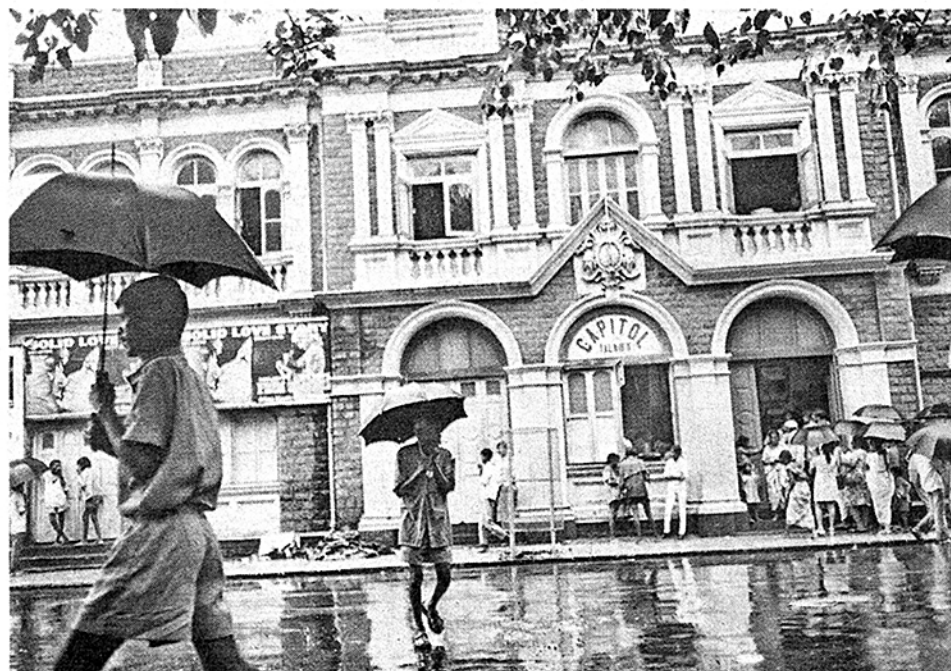
Capital Talkies Building, Bombay - circa 1979