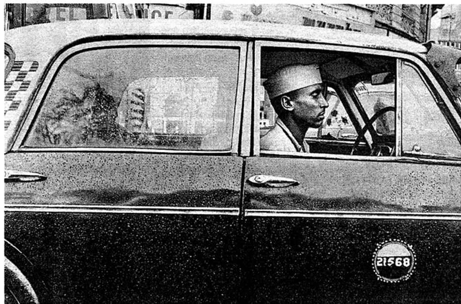
Taxi Driver with Passengers, Bombay - circa 1979