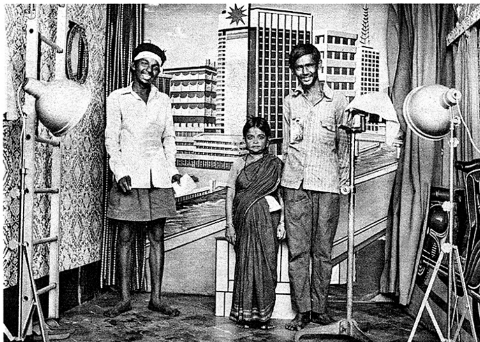
Roadside Photo Studio, Bombay - circa 1979.