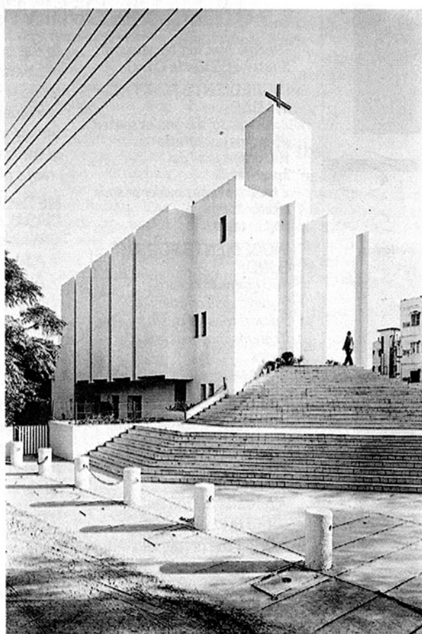
→ Syrian Orthodox Church, 1982. Architect: The Design Group