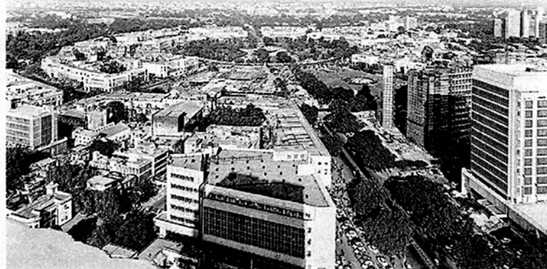
↙ Aerial view of the construction of the Palika parking in Connaught Place, 1983.

Curated by Ram Rahman, and on display at PhotoInk in Delhi until June 21, these photographs of the capital's buildings from the 1950s to the 1980s in the exhibition Delhi Modern: The Architectural Photographs of Madan Mahatta give you a sense of Nehruvian modernism in architecture. Celebrate the glory days of Indian modernism and some of its finest architects through these portraits of the city