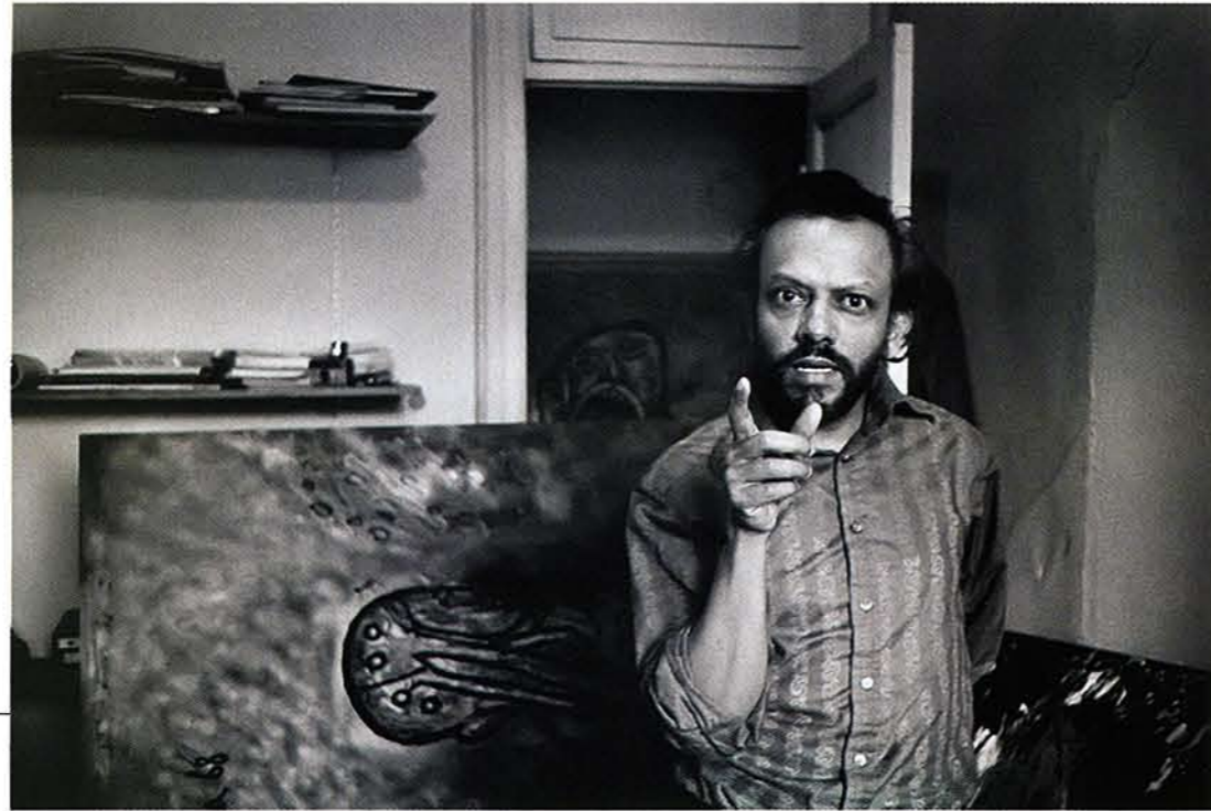
F.N. Souza at his apartment, New York, 1970-71

became an integral part of his life, with the many shows of contemporary Indian art he organized internationally.