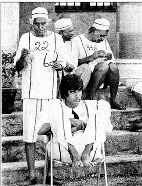
■ Amitabh Bachchan with a few ageing extras during a Bollywood shoot

— The author is a documentary photographer based in Delhi. He is best known for images from the Bhopal gas tragedy of 1984 and more recently, of the Sri Lankan unrest. These images are a part a show called 'Chronicles of a past life — Bombay', on at Photoink, till February 25.