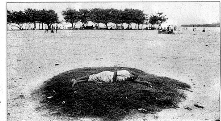
■ A man asleep at Chowpatty in the 80s. The beach wears a different look now