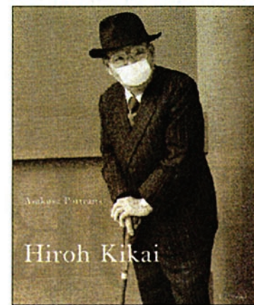
The life of a policeman and life on the Tokyo street are both subjects of classic Steidl books, On Duty (left) and the Asakusa Portraits (right)

Also, there's a collection of thirties' prodigy Berenice Abbot's photo essays of New York before World War II, and of Continental literature's enfant terrible Jean Cocteau in bed with a mask. Richard Avedon's Portraits of Power , Walker Evans' book on picture postcards and Bruce Davidson's circus pictures — all occupy pride of place on the bookshelves.