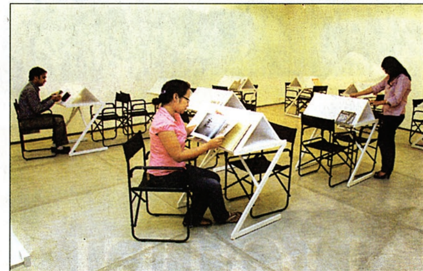
Visitors browse the books from the Steidl collection at the Photoink gallery, Delhi. (Top right) Malick Sidibé's Photographs is an important Africa book