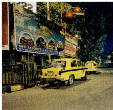
Two of the 41 works on display at the exhibition