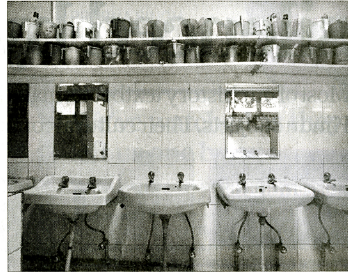
The Lawrence School, Sanawar