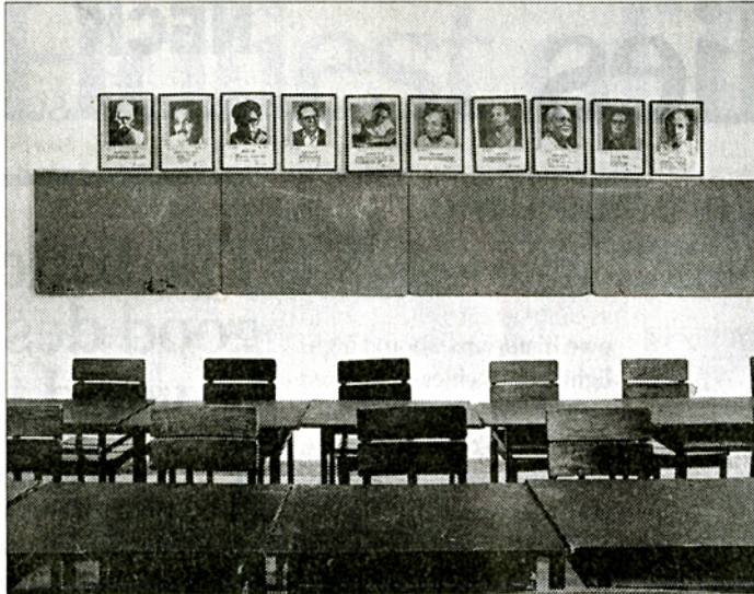
The Doon School, Dehradun